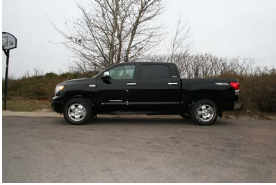
Vehicle BEFORE Installation