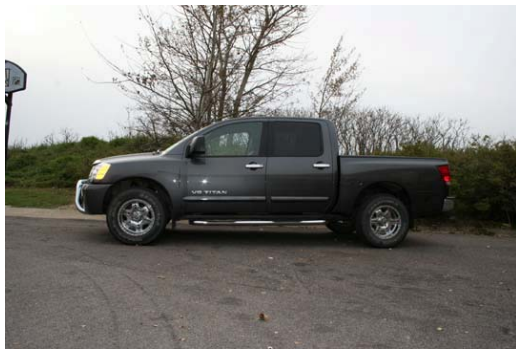
Vehicle BEFORE Installation